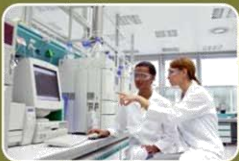
Bio Analytical Research