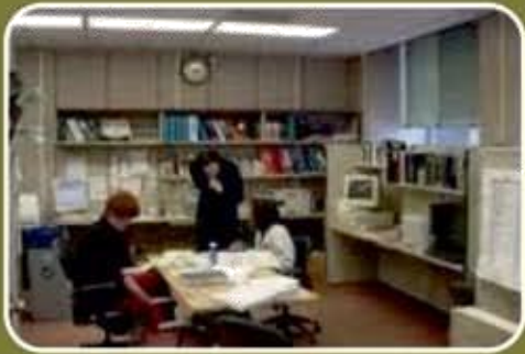
Drug Information Centre