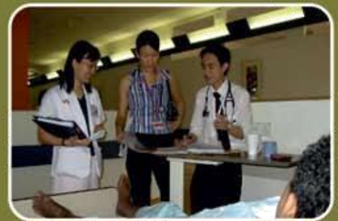
Ward Round Participation